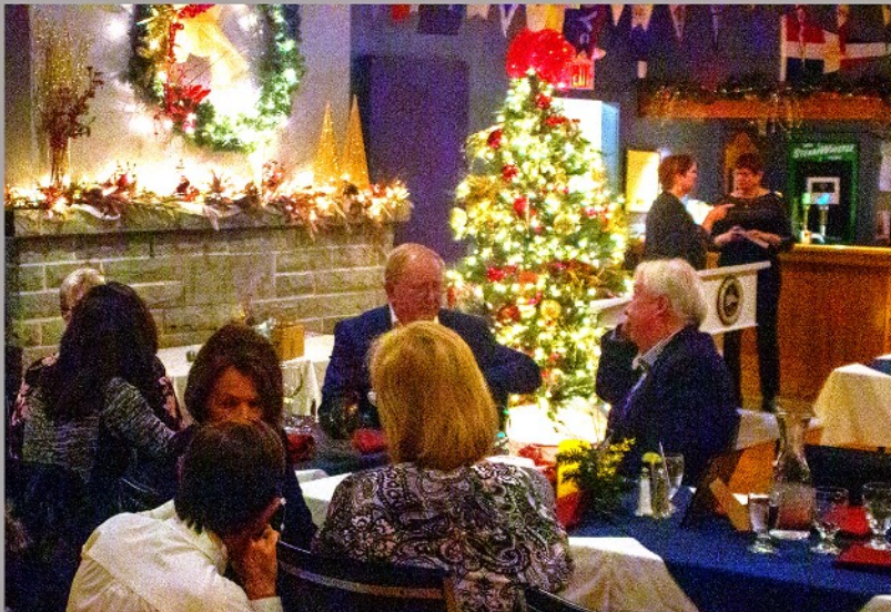
NPARC's HolidayDinner Dalhousie Yacht Club Dec. 6th.

I'm helping renovate our bathroom. Not a great idea just before Christmas. I should be laying in the grog and mincemeat tarts for the holidays. Take my advise and don't make serious home improvements weeks away from the Yule Time Season. Today was tile cutting day. Tomorrow is grouting and vinyl floor laying day. Last weekend I soldered enough half inch copper pipe to make several 2 meter j-poles and a homemade loop antenna. The project must wrap in four days. So while I still have my whits about me, Best Wishes and Happy Holidays from the FEEDLINE team. That's me and all our contributors to the NPARC newsletter. I hope Santa brings you the radio of your dreams. Let me know if you get new gear. Better yet send me a photo of you, your new rig with a holiday theme. Maybe you'll make the January FEEDLINE front page.