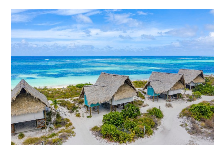
MY KIND OF SOCIAL DISTANCING.