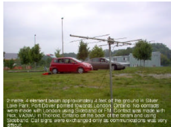
2 metre, 4 element beam approximately 4 feet off the ground in Silver Lake Park, Port Dover pointed towards London, Ontario. No contacts were made with London using Sideband or FM. Contact was made with Rick, VA3WJ in Thorold, Ontario off the back of the beam and using Sideband. Call signs were exchanged only as communications was very difficult.