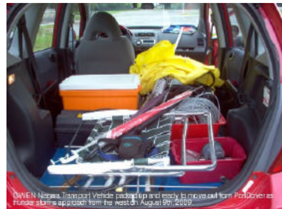
GWEN Niagara Transport Vehicle packed up and ready to move out from Port Dover as thunder storms approach from the west on August 9th, 2009.