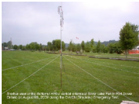
Another view of the Butternut HF6V vertical antenna at Silver Lake Park in Port Dover, Ontario on August 9th, 2009 during the GWEN Simulated Emergency Test.