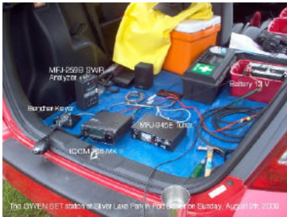
The GWEN SET station at Silver Lake Park in Port Dover on Sunday, August 9th, 2009.