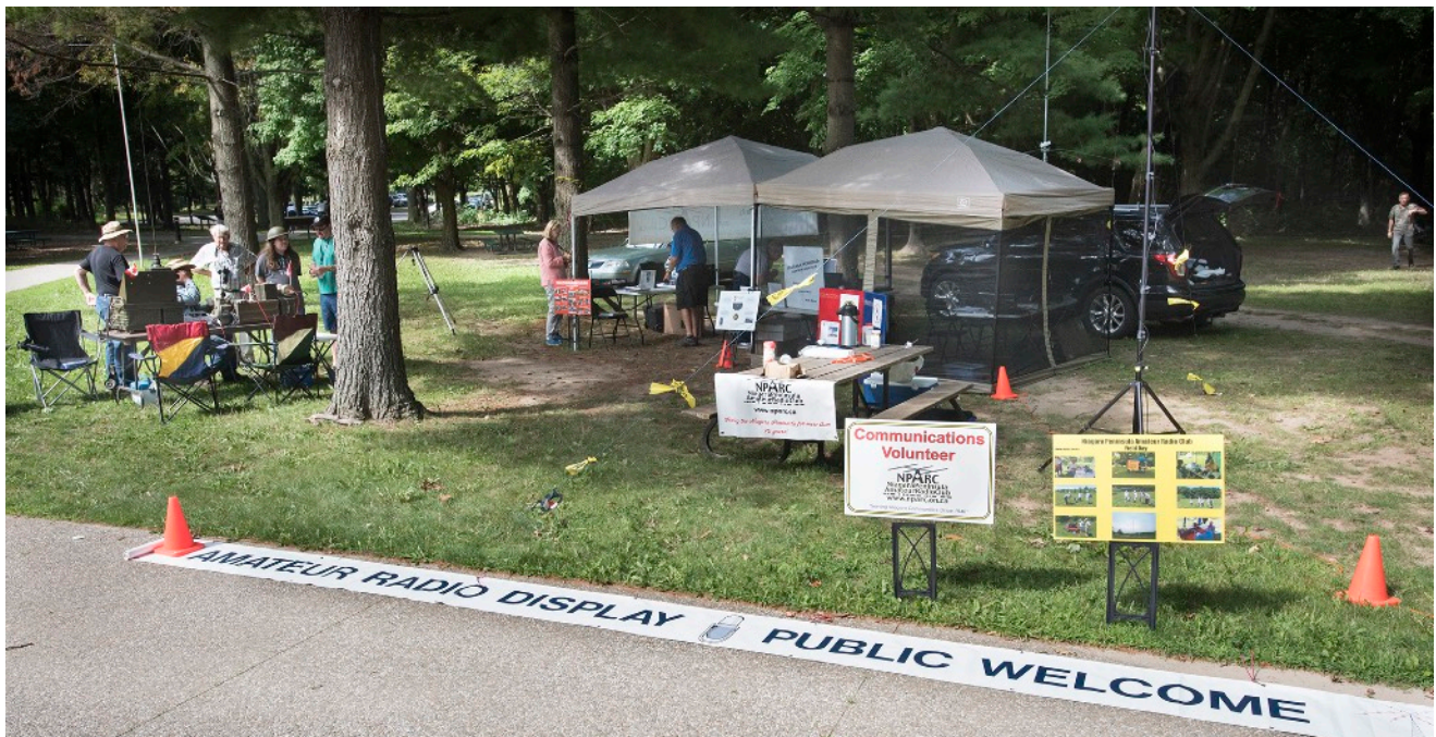
The NPARC display was setup in front of the Fort George welcome centre.